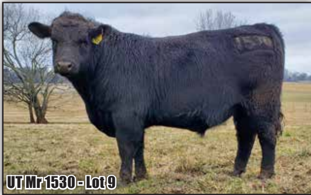
UT Mr 1530 - Lot 9