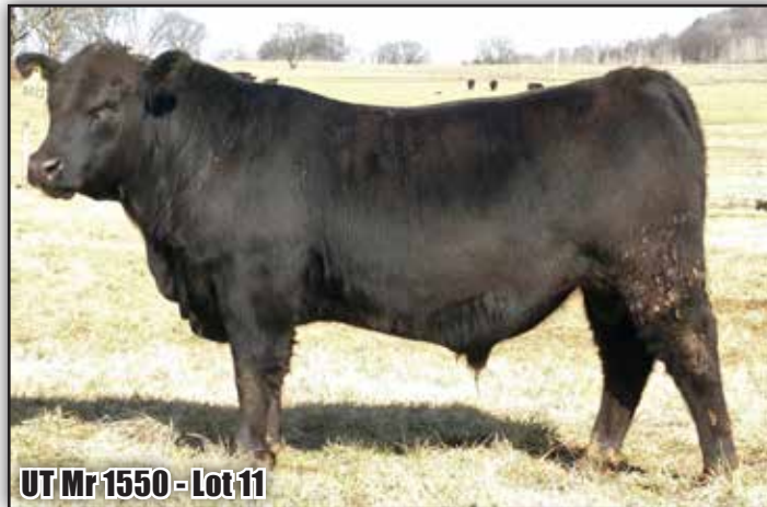
UT Mr 1550 - Lot 11

• A bull out of the current herd sire 1166, back to Bushes Sure Deal 33.