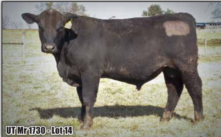
UT Mr 1730 - Lot 14