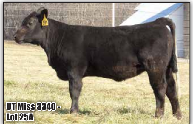
UT Miss 3340 - Lot 25A

• Due to calve to G A R Quantum, Reg. 18636059, on 9/26/2021. Sells with Lot 25A at side.