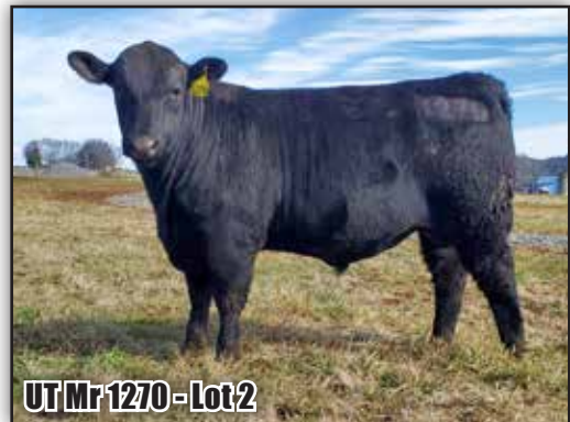
UT Mr 1270 - Lot 2