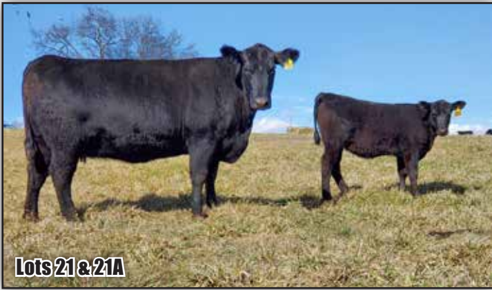
Lots 21 & 21A

• Due to calve to Deer Valley Growth Fund, Reg. 18827828, on 9/26/2021. Sells with 21A at side.