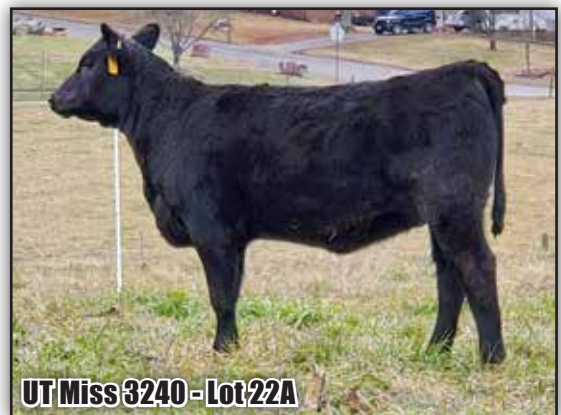
UT Miss 3240 - Lot 22A