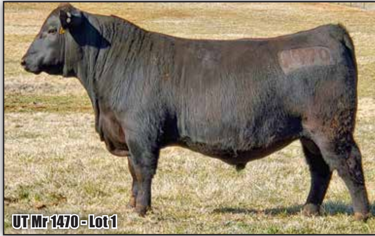
UT Mr 1470 - Lot 1