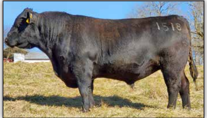
UT Mr 1518 - Sire Lot 21A.