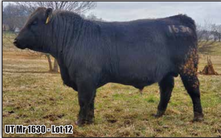
UT Mr 1630 - Lot 12