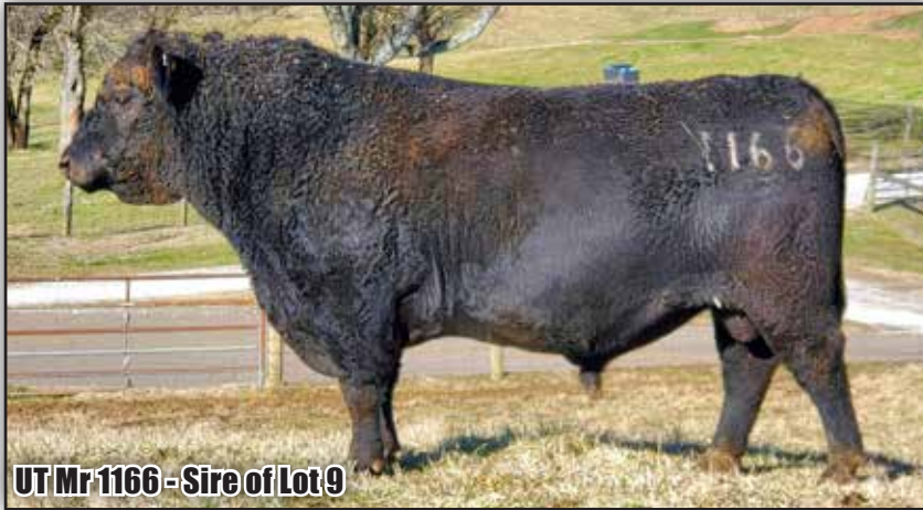
UT Mr 1166 - Sire of Lot 9