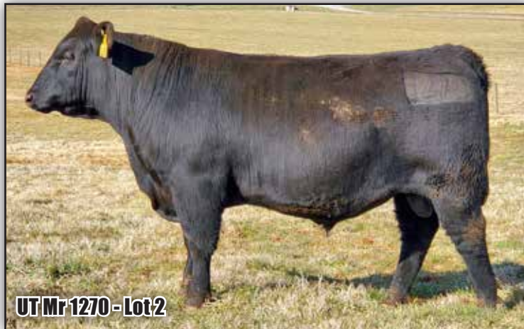
UT Mr 1270 - Lot 2