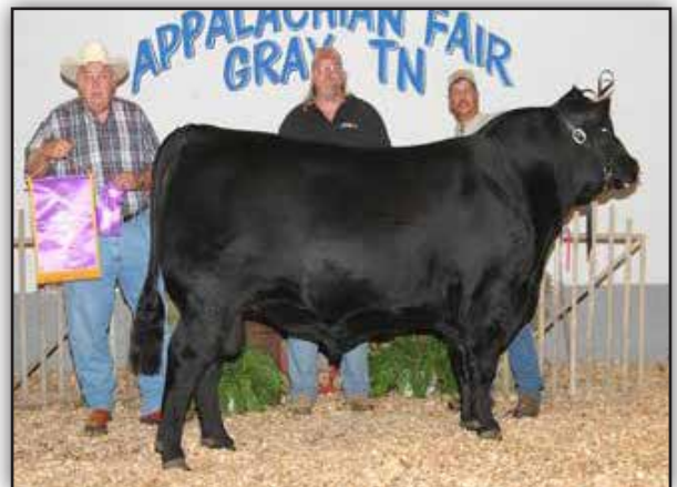
UT Mr 1451 Champion Bull/Appalachian Fair - Sire of Lot 8.

• Due to calve to Deer Valley Growth Fund, Reg. 18827828, on 9/26/2021. Sells with 22A at side.