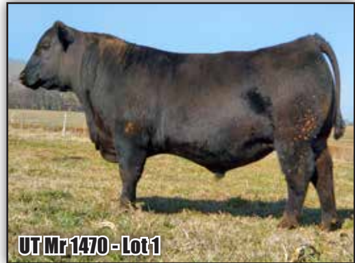
UT Mr 1470 - Lot 1

• Musgrave Stunner son out of the Pathfinder Dam 2351. Qualifies TAEP Calving Ease.