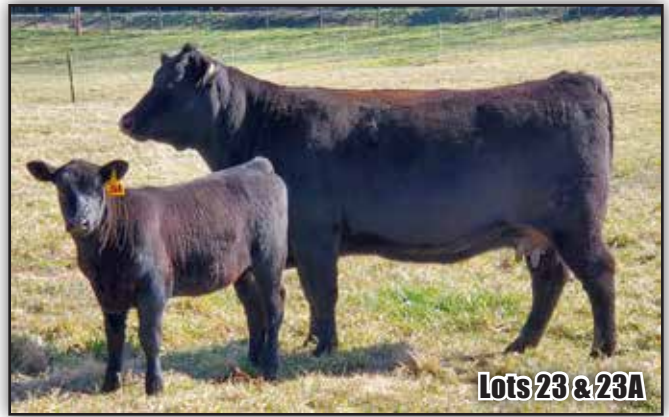
Lots 23 & 23A

• Pathfinder Cow due to calve to Deer Valley Growth Fund, Reg. 18827828, on 9/26/2021. Sells with 23A at side.